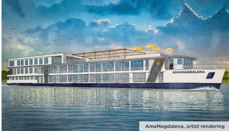
AmaMagdalena, artist rendering

7-night river cruise | May 24-31, 2025 | aboard AmaMagdalena